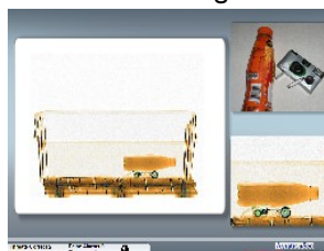
Feedback with IED photo Level 1.

IEDware has been designed by a psychologist with experience in research and X-ray training screener software development over many years.